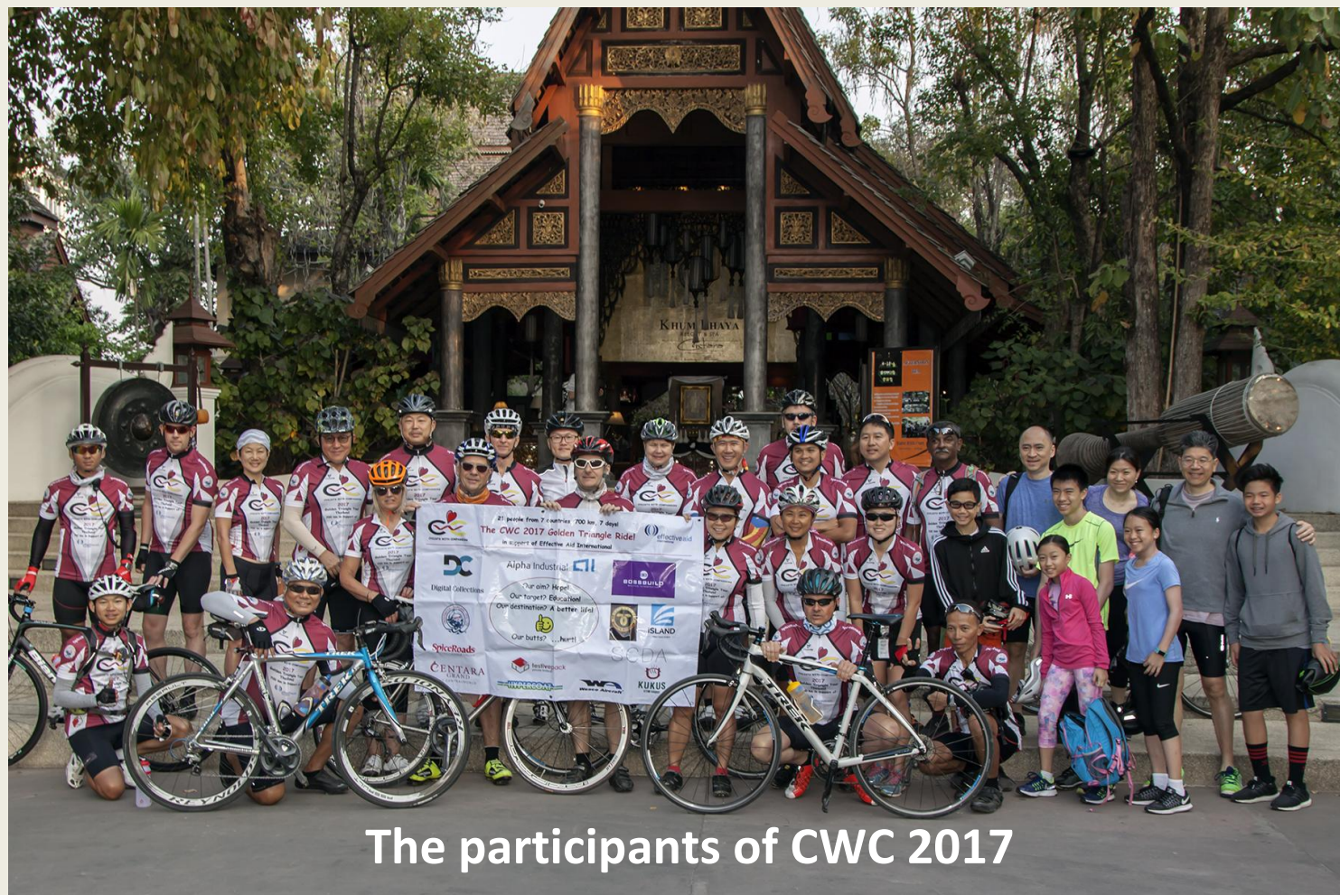
The participants of CWC 2017